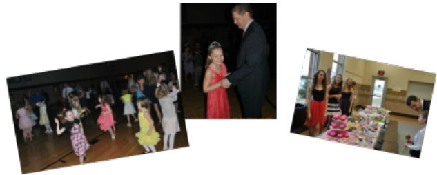
Scenes from Last Year's Father/Daughter Dance