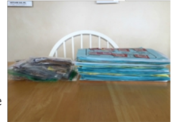
"Guess how many Box Tops are in this picture? ..... $222.00 worth!"